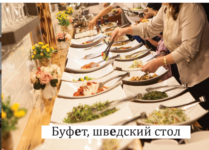
Буфет, шведский стол