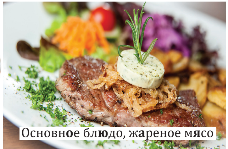
Основное блюдо, жареное мя́со